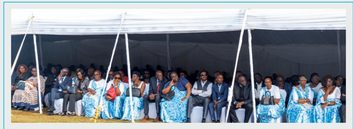
Members of Unity Club at the funeral of the late Amb. Monique MUKARULIZA