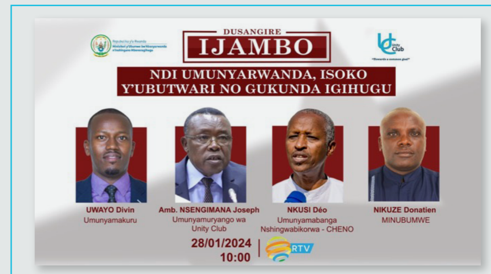
The January talk show on Ndi Umunyarwanda was organized to celebrate Rwanda's Heroes' Day

In a monthly talk show on Ndi Umunyarwanda that took place in January 2024, The Chancellery for Heroes, National Orders and Decorations of Honour (CHENO), identified Ndi Umunyarwanda as a source of courage and patriotism.