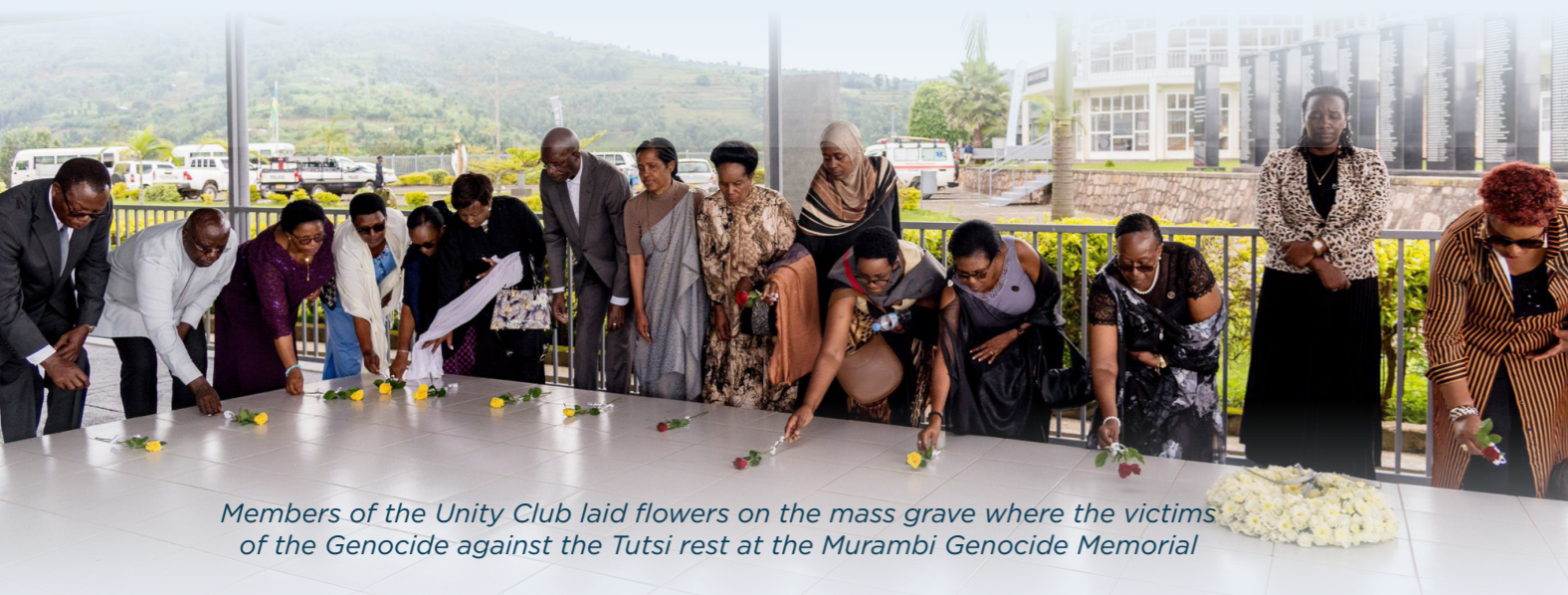
Members of the Unity Club laid flowers on the mass grave where the victims of the Genocide against the Tutsi rest at the Murambi Genocide Memorial

Message by H.E Jeannette KAGAME regarding the 30 th Commemoration of the 1994 Genocide against the Tutsi