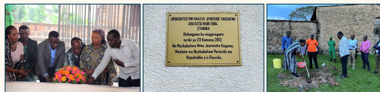
Staff from Unity Club Secretariat laid flowers on the mass grave where the victims of the Genocide against the Tutsi rest at the Cyanika Genocide Memorial

On June 23, 2012, First Lady Jeannette KAGAME, officially inaugurated Cyanika Genocide Memorial where 40,000 victims of the 1994 Genocide Against the Tutsi are buried. This memorial was built after an advocacy by the Unity Club.