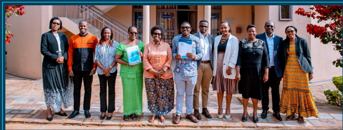
Both sides are happy with the partnership

Through the agreement, the two sides are committed to cooperate in various projects and activities related to the development of a culture of Peace, Unity and Resilience with a focus on dialogue, especially among the young people.