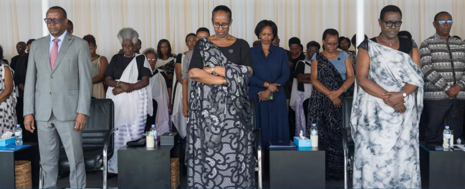
H.E First Lady Jeannette KAGAME observes a moment of silence to pay tribute to victims of the Genocide against the Tutsi.

Unity Club's Chairperson, H.E First Lady Jeannette KAGAME, on Tuesday, June 4, 2024, joined elderly survivors of the 1994 Genocide against the Tutsi known as "Intwaza" in Huye to commemorate and honour the victims of the Genocide.