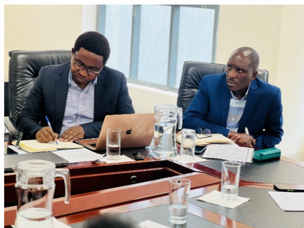
The meeting brought together Researchers from both Unity Club and MINUBUMWE

Both sides are determined to increase cooperation in conducting quality research to be used by the relevant institutions in making decisions and establishing programs and policies that strengthen unity and resilience among Rwandans.