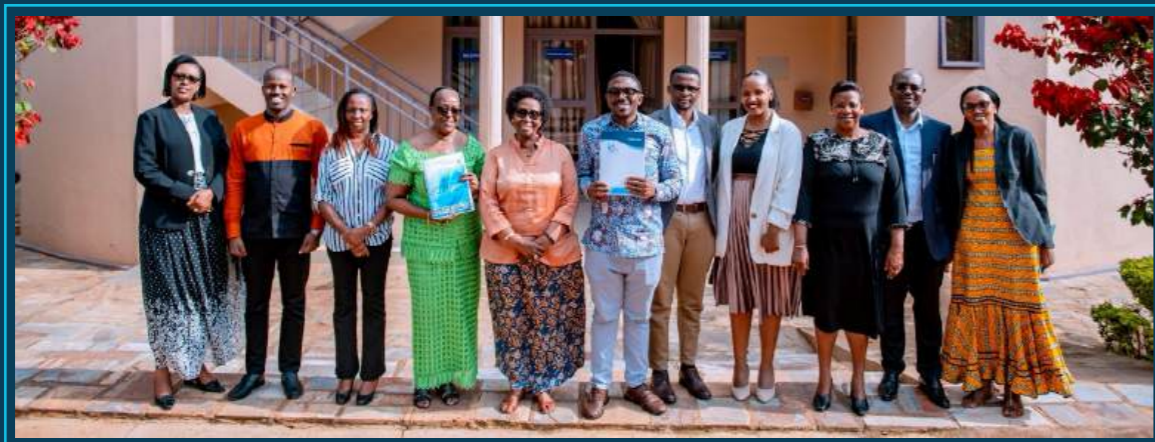
Abakozi ku mpande zombi bishimiye aya masezerano

Binyuze muri ayo masezerano, impande zombi ziyemeje gufatanya mu mishanga n'ibikorwa binyuranye bijyanye no guteza imbere umuco w'amahoro, ubumwe n'ubudaheranwa hibandwa ku biganirwa cyane cyane mu rubyiruko.