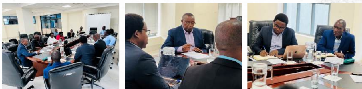
Abahagarariye Sukomisiyo y'Ubushakashatsi muri Unity Club mu nama n'Abashakashatsi ba MINUBUMWE

Ibi byashimangiye mu nama yahuje Sukomisiyo y'Ubushakashatsi muri Unity Club n'abashakashatsi bo muri MINUBUMWE, inama yabereye ku cyicaro cya Minisitiri y'Ubumwe bw'Abanyarwanda n'Inshingano Mboneragihugu, tariki 30 Mutarama 2024.