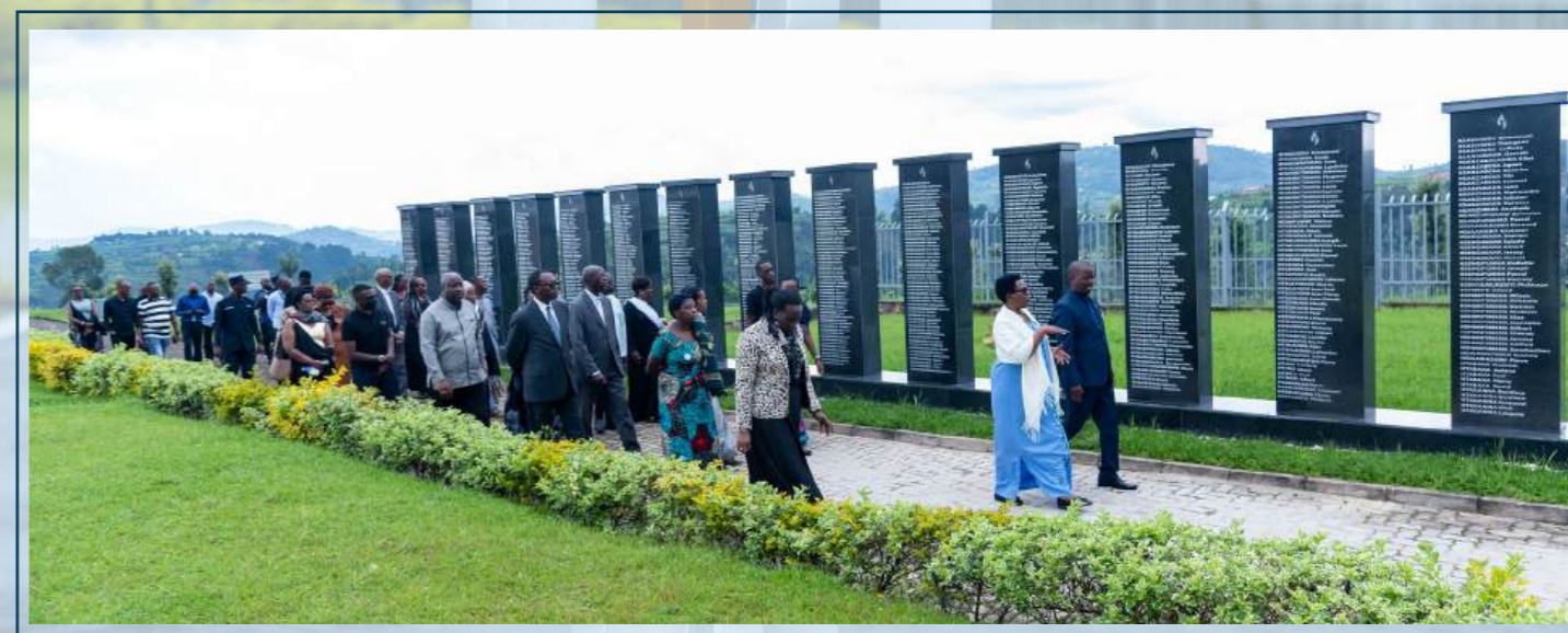
Abanyamuryango basuye Urwibutso rwa Murambi basobanukirwa umwihariko wa Jenoside yakorewe Abatutsi muri aka gace