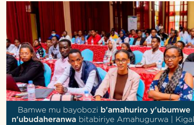
Bamwe mu bayobozi b'amahuriro y'ubumwe n'ubudaheranwa bitabiriye Amahugurwa | Kigali

atangiza icyiciro cya Kane cy'Umushinga kuri site ya Kigali