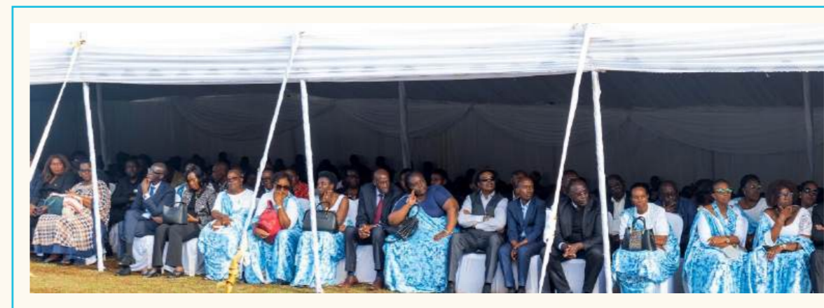
Abanyamuryango ba Unity Club baherekeje bwa nyuma Amb. Monique MUKARULIZA Ubutumwa burata ubutwari Intwararumuri Mukaruliza busoza bugira buti:

Umunyamabanga Mukuru akaba n'Umunyamabanga Nshingwabikorwa