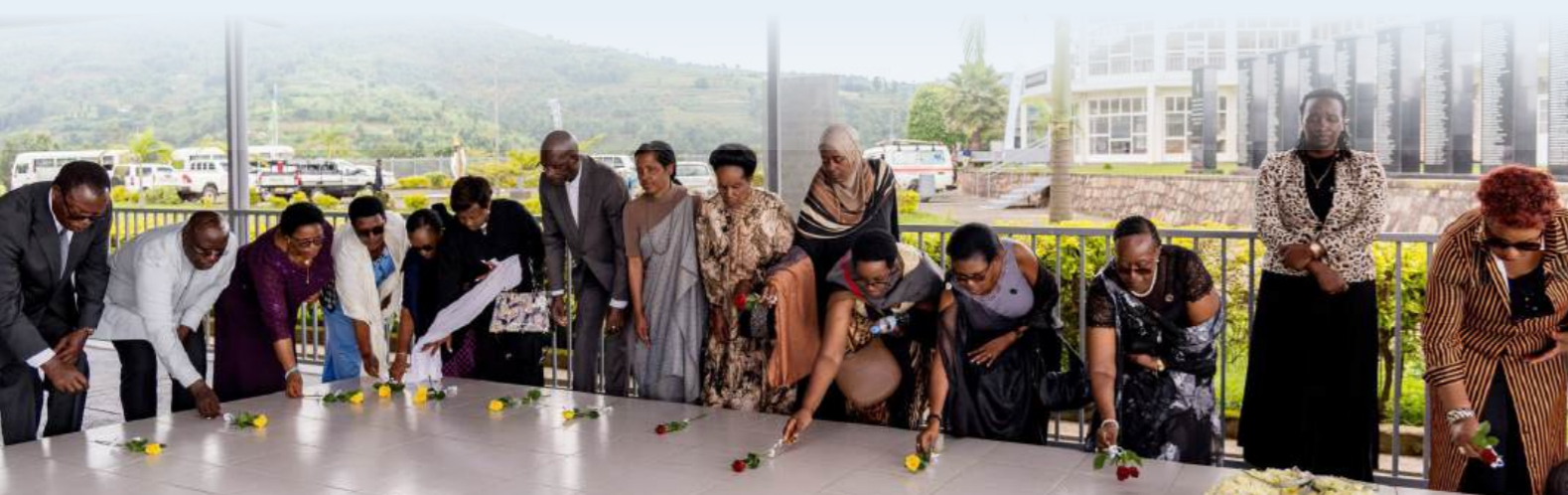
Abanyamuryango ba Unity Club bashyira indabo ku mva rusange iruhukiyemo abazize Jenoside yakorewe Abatutsi ku Rwibutso rwa Murambi

Ubutumwa Nyakubahwa Madamu Jeannette KAGAME yageneye Abanyarwanda mu gihe cyo Kwibuka ku nshuro ya 30 Jenoside yakorewe Abatutsi